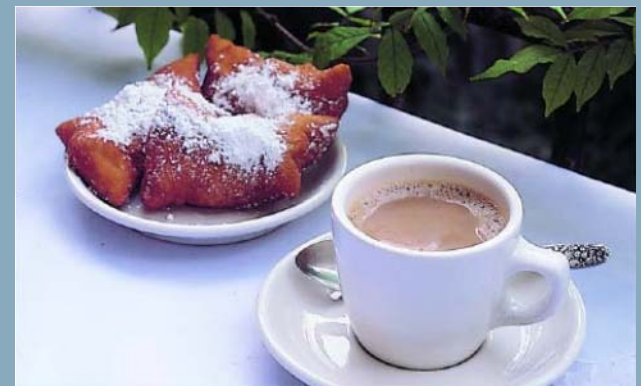
ABOVE: While in New Orleans, discover what makes its Dixieland jazz so popular, and treat yourself to an order of café au lait and beignets covered in powdered sugar. Here's a tip—don't wear black!